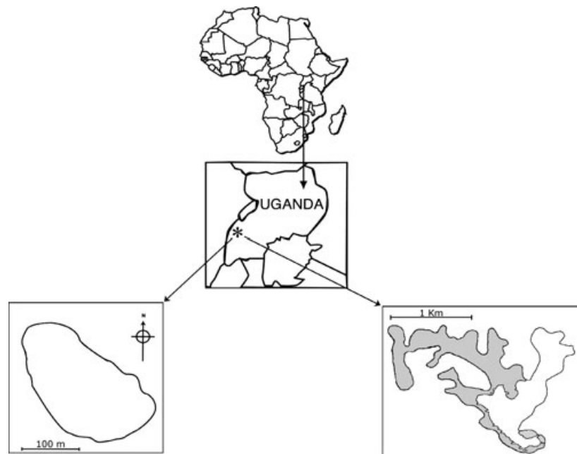
Fig 1 Diagram of Lake Nukurba (lower left) and Lake Saka (lower right), and their location in Uganda. The grey areas around Lake Saka are wetlands

has a weak rim, 3–15 m high, so is exposed to direct light all day. The drainage basin, including several wetland areas, around the lake has been almost totally cleared for agricultural production, which has led to ‘hyper-eutrophic’ conditions with high chlorophyll ( >130 \mu\text{g l}^{-1} ) and low secchi depths ( \sim 0.5 m). Lake Saka has recently experienced increased phytoplankton productivity and severe algal blooms (Crisman et al. , 2001).